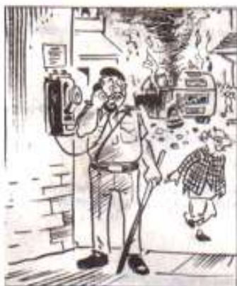
Image 4: Laxman R.K. 1 October 2008 Agent: Police Constable Patient: Police Officer Bystander: Common Man, Reader Speech: 'Reporting a burning bus, sir. Don't know if it is related to terrorism, linguism, communalism, secessionism, goondaism, reservation, border...' Speech Act: Reporting Spatial Context: Public telephone booth, a burning bus in an open space Theme: Social violence