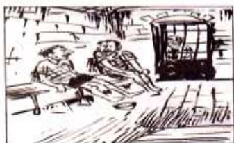
Figure 1: Laxman R.K. 8 September 2008 Agent: Prisoner Patient: Another Prisoner Bystander: Common Man, Reader Speech: 'Yes, I went underground soon after committing the crime. But it was so overcrowded; there was not even standing space. So, I came out and was arrested! Speech act: Explanation Spatial Context: Prison-cell with lots of space Theme: Crime-rate

What makes the cartoons appearing under You Said It title an interesting reading from semio-pragmatic angle is the unique combination of the visual and the verbal. The humour or satire solely depends on this combination. The mere visual aspect would not achieve this effect. In fact, in many of his cartoons, his linguistic strokes appear to be stronger than his brush strokes. The title 'You Said It' is self-explanatory. The significance of what is 'said' depends, at times, on 'who' said it, the speech situation and the non-verbal reaction of the silent listener that is the 'Common Man'. For the analysis purpose, 10 cartoons that appeared in the newspaper Times of India between August 2008 and November 2008 have been shortlisted based on the wide range of social issues these include. The analysis uses the concept of speech act and the terms: agent (the speaker/initiator of the speech action), bystander (non-active participant in the speech act), and patient (recipient of the speech action) mainly from the domain of Pragmatics (See Gezgin 2004).