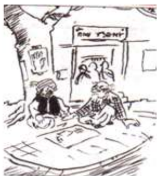
Image 9: Laxman R.K. 1 October 2008 Agent: An astrologer Patient: common Man Bystander: Reader Speech: 'what do you mean, you will not have any? According to my reading you will have a lot of financial problems. Are you going to believe me or the finance minister? Speech Act: Rhetoric question Spatial Context: Public telephone booth, a burning bus in an open space Theme: Social violence