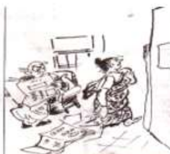
Image 7: Laxman R.K. 1 October 2008 Agent: Chief Minister's Wife Patient: Common Man Bystander: Reader Speech: 'I am tired of reading about those bomb-blasts and terrorist attacks! Normal news about corrupt ministers, bribe taking officials seems to have disappeared!' Speech Act: Expressing boredom/ detest (comment) Spatial Context: House Theme: Social violence and corruption

Image 6: Laxman R.K. 1 October 2008 Agent: A beggar Patient: Another Beggar Bystander: Common Man, Reader Speech: 'If the economy gets worse, I will offer to join the moon mission and go to the moon and try my luck there. I am sure it will be better!' Speech Act: Speculation Spatial Context: Pavement Theme: Economic Crisis