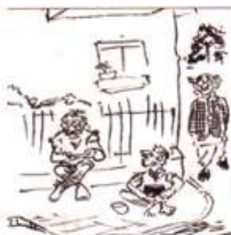
Image 6: Laxman R.K. 1 October 2008 Agent: A beggar Patient: Another Beggar Bystander: Common Man, Reader Speech: 'If the economy gets worse, I will offer to join the moon mission and go to the moon and try my luck there. I am sure it will be better!' Speech Act: Speculation Spatial Context: Pavement Theme: Economic Crisis

Image 4: Laxman R.K. 1 October 2008 Agent: A Citizen Patient: Common Man Bystander: Reader Speech: 'He came howling about bomb scare and this chap came from that side shouting about the US stock market crisis and they dashed against each other!' Speech Act: Reporting Spatial Context: Public space, two men lying, newspapers in their hands Theme: Socio-economic crisis