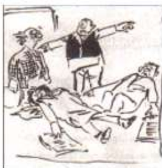
Image 4: Laxman R.K. 1 October 2008 Agent: A Citizen Patient: Common Man Bystander: Reader Speech: 'He came howling about bomb scare and this chap came from that side shouting about the US stock market crisis and they dashed against each other!' Speech Act: Reporting Spatial Context: Public space, two men lying, newspapers in their hands Theme: Socio-economic crisis

Image 4: Laxman R.K. 1 October 2008 Agent: Police Constable Patient: Police Officer Bystander: Common Man, Reader Speech: 'Reporting a burning bus, sir. Don't know if it is related to terrorism, linguism, communalism, secessionism, goondaism, reservation, border...' Speech Act: Reporting Spatial Context: Public telephone booth, a burning bus in an open space Theme: Social violence